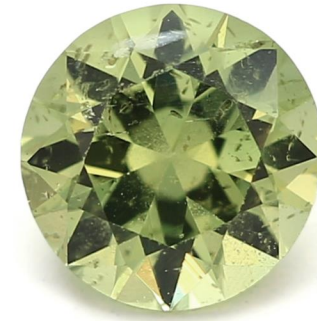
Crown (Top) View