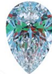
Optical Symmetry Good

Optical Symmetry Analysis: The colored areas of the symmetry image are indications of light handling ability, giving a visual representation of proportions and facet alignment.