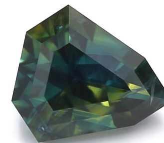
Crown (Top) View