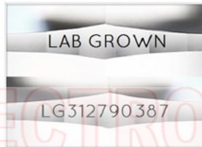
Girdle laser inscribed "LAB GROWN" and "LG312790387"

*Comments: This laboratory grown diamond was created by the HPHT (High Pressure High Temperature) method, and has the same chemical, physical, and optical properties as a mined diamond.