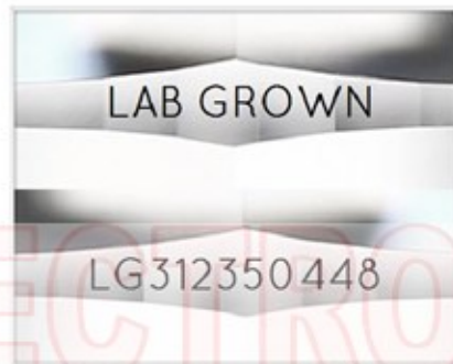
Girdle laser inscribed "LAB GROWN" and "LG312350448"

*Comments: This laboratory grown diamond was created by the CVD (Chemical Vapor Deposition) method, and has the same chemical, physical, and optical properties as a mined diamond. This diamond is Type IIa, which means it is devoid of nitrogen impurities.