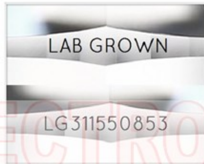
Girdle laser inscribed "LAB GROWN" and "LG311550853"

*Comments: This man-made diamond was grown in a laboratory by the HPHT method, and has the same chemical, physical, and optical properties as a natural earth mined diamond.