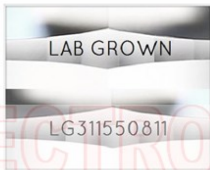
Girdle laser inscribed "LAB GROWN" and "LG311550811"

*Comments: This man-made diamond was grown in a laboratory by the HPHT method, and has the same chemical, physical, and optical properties as a natural earth mined diamond.