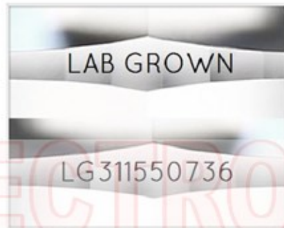
Girdle laser inscribed "LAB GROWN" and "LG311550736"

*Comments: This man-made diamond was grown in a laboratory by the HPHT method, and has the same chemical, physical, and optical properties as a natural earth mined diamond.