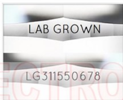
Girdle laser inscribed "LAB GROWN" and "LG311550678"

*Comments: This man-made diamond was grown in a laboratory by the HPHT method, and has the same chemical, physical, and optical properties as a natural earth mined diamond.