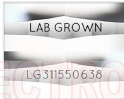
Girdle laser inscribed "LAB GROWN" and "LG311550638"

*Comments: This man-made diamond was grown in a laboratory by the HPHT method, and has the same chemical, physical, and optical properties as a natural earth mined diamond.