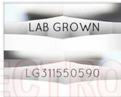
Girdle laser inscribed "LAB GROWN" and "LG311550590"

*Comments: This man-made diamond was grown in a laboratory by the HPHT method, and has the same chemical, physical, and optical properties as a natural earth mined diamond.