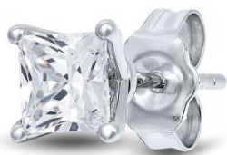
Photo of jewelry style, not actual size

*Comment: These man-made diamonds were grown in a laboratory and have the same chemical, physical, and optical properties as a natural earth mined diamond. The lab grown diamonds were graded prior to mounting