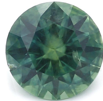
Crown (Top) View