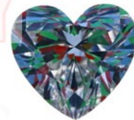
Optical Symmetry Good

The colored areas of the symmetry image are indications of light handling ability, giving a visual representation of proportions and facet alignment.