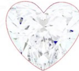
Optical Brilliance Excellent

Brilliance is the overall return of light to the viewer. The brilliance image is a representation of (a) white areas of light return, or brilliance, and (b) dark-blue areas of light loss.