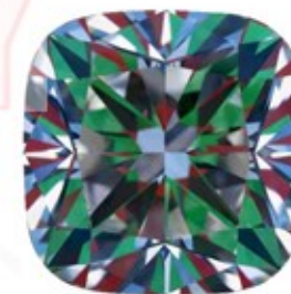
Optical Symmetry Very Good

The colored areas of the symmetry image are indications of light handling ability, giving a visual representation of proportions and facet alignment.