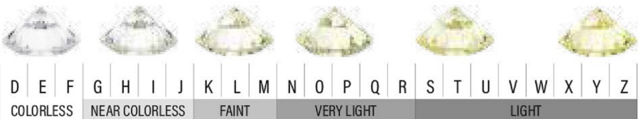
D - Z DIAMOND COLOR GRADING SCALE