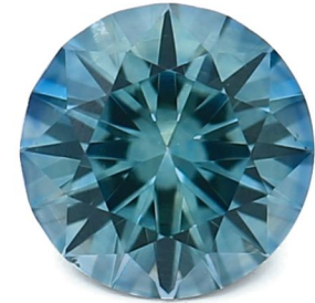
Crown (Top) View