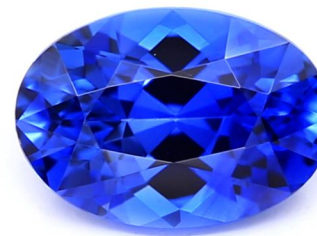
Crown (Top) View