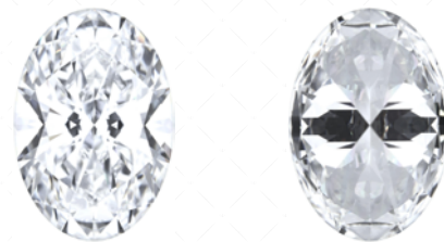
Actual photographs of the crown and pavilion of this lab grown diamond. View hi-resolution photos at GCALUSA.com