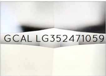
Illustration depicts approx. girdle appearance