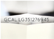
Illustration depicts approx. girdle appearance