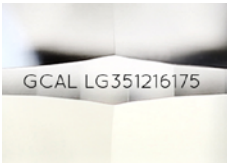
Illustration depicts approx. girdle appearance