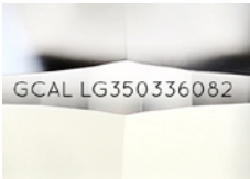
Illustration depicts approx. girdle appearance