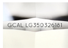
Illustration depicts approx. girdle appearance