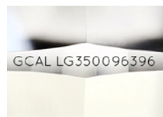
Illustration depicts approx. girdle appearance