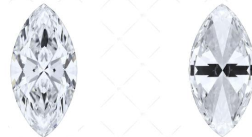
Actual photographs of the crown and pavilion of this lab grown diamond. View hi-resolution photos at GICALUSA.com