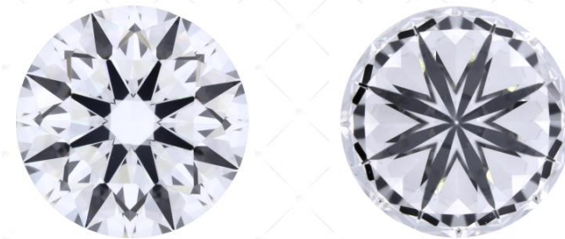
Actual photographs of the crown and pavilion of this lab grown diamond. View hi-resolution photos at GICALUSA.com