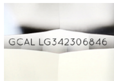
Illustration depicts approx. girdle appearance