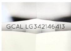
Illustration depicts approx. girdle appearance