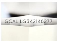
Illustration depicts approx. girdle appearance