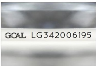
Illustration depicts approx. girdle appearance