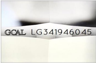
Illustration depicts approx. girdle appearance