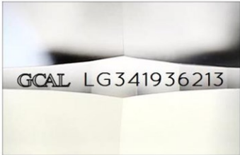
Illustration depicts approx. girdle appearance