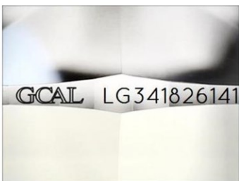
Illustration depicts approx. girdle appearance