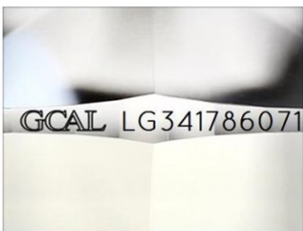
Illustration depicts approx. girdle appearance