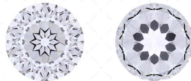
Actual photographs of the crown and pavilion of this lab grown diamond. View hi-resolution photos at GICALUSA.com

Clarity Characteristics and Locations Cloud Pavilion