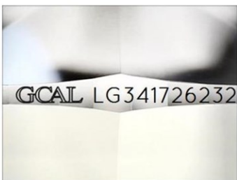
Illustration depicts approx. girdle appearance