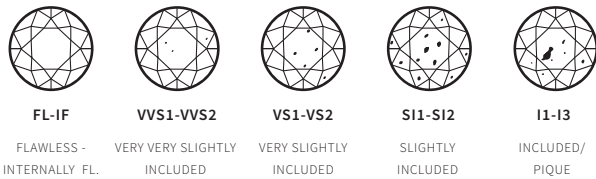
For illustration purposes only