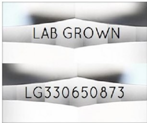
Illustration depicts approx. girdle appearance