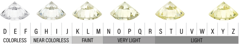
D - Z DIAMOND COLOR GRADING SCALE