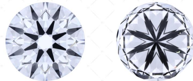
Actual photographs of the crown and pavilion of this lab grown diamond. View hi-resolution photos at GICALUSA.com