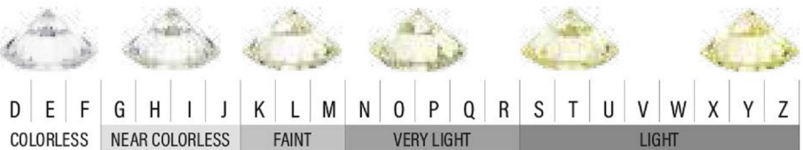
D - Z DIAMOND COLOR GRADING SCALE