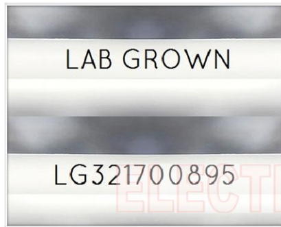
Girdle laser inscribed "LAB GROWN" and "LG321700895"

*Comments: This laboratory grown diamond was created by the CVD (Chemical Vapor Deposition) method, and has the same chemical, physical, and optical properties as a mined diamond. This diamond is Type IIa, which means it is devoid of nitrogen impurities.