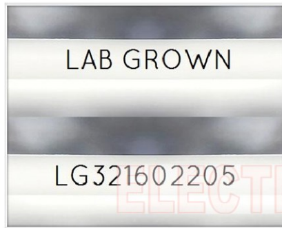
Girdle laser inscribed "LAB GROWN" and "LG321602205"

*Comments: This laboratory grown diamond was created by the CVD (Chemical Vapor Deposition) method, and has the same chemical, physical, and optical properties as a mined diamond. This diamond is Type IIa, which means it is devoid of nitrogen impurities.