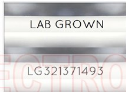
Girdle laser inscribed "LAB GROWN" and "LG321371493"

*Comments: This laboratory grown diamond was created by the CVD (Chemical Vapor Deposition) method, and has the same chemical, physical, and optical properties as a mined diamond. This diamond is Type IIa, which means it is devoid of nitrogen impurities.