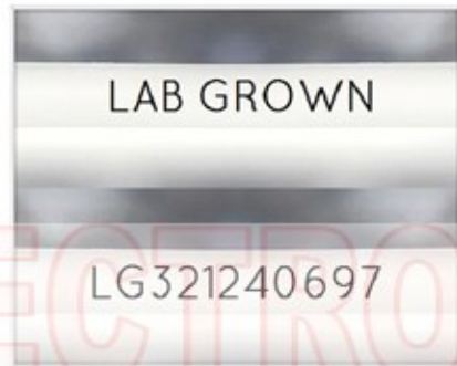
Girdle laser inscribed "LAB GROWN" and "LG321240697"

*Comments: This laboratory grown diamond was created by the CVD (Chemical Vapor Deposition) method, and has the same chemical, physical, and optical properties as a mined diamond. This diamond is Type IIa, which means it is devoid of nitrogen impurities.