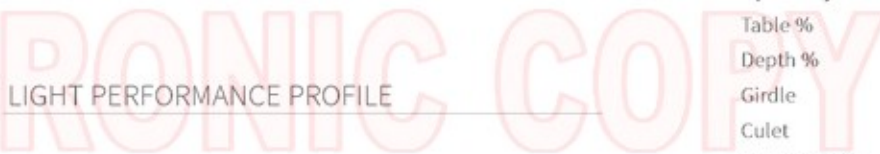
LIGHT PERFORMANCE PROFILE