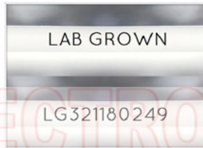
Girdle laser inscribed "LAB GROWN" and "LG321180249"

*Comments: This laboratory grown diamond was created by the CVD (Chemical Vapor Deposition) method, and has the same chemical, physical, and optical properties as a mined diamond. This diamond is Type IIa, which means it is devoid of nitrogen impurities.