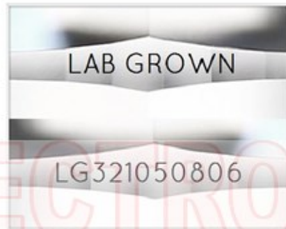
Girdle laser inscribed "LAB GROWN" and "LG321050806"

*Comments: This laboratory grown diamond was created by the CVD (Chemical Vapor Deposition) method, and has the same chemical, physical, and optical properties as a mined diamond. This diamond is Type IIa, which means it is devoid of nitrogen impurities.