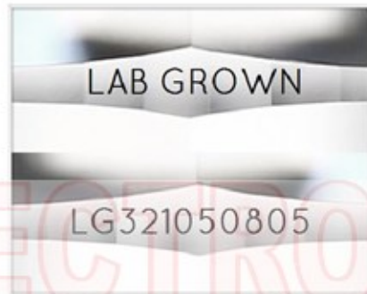
Girdle laser inscribed "LAB GROWN" and "LG321050805"

*Comments: This laboratory grown diamond was created by the CVD (Chemical Vapor Deposition) method, and has the same chemical, physical, and optical properties as a mined diamond. This diamond is Type IIa, which means it is devoid of nitrogen impurities.